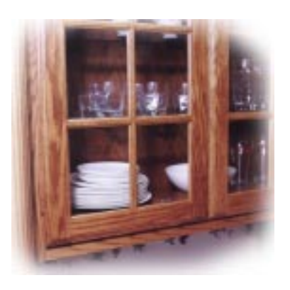
WOOD DOORS APPLIANCE PANELS SPECIALTY DOORS CUSTOMER SERVICE EXCEPTIONAL QUALITY